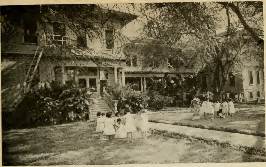
In Honolulu, Susannah Wesley Home provides happy surroundings for girls